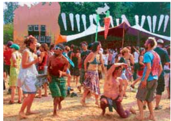
RÖMER + RÖMER: Tanz auf der Seebühne (2015) | 110 x 150 cm | Öl auf Leinwand | © RÖMER + RÖMER, Courtesy Galerie Michael Schultz / Foto: Eric Tschernow