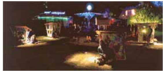
RÖMER + RÖMER: Chill Out zur Geisterstunde (2015) | 70 x 160 cm | Öl auf Leinwand | © RÖMER + RÖMER, Courtesy Galerie Michael Schultz / Foto: Eric Tschernow