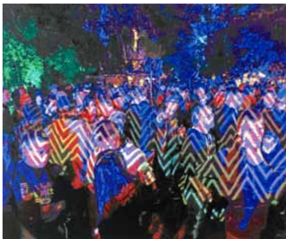
RÖMER + RÖMER: Party Sträflinge (2014) | 200 x 250 cm | Öl auf Leinwand | © RÖMER + RÖMER, Courtesy Galerie Michael Schultz / Foto: Eric Tschernow