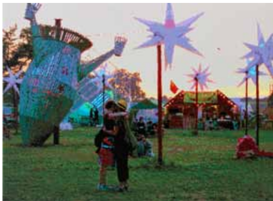
RÖMER + RÖMER: Sputnik (2015) | 110 x 150 cm | Öl auf Leinwand | © RÖMER + RÖMER, Courtesy Galerie Michael Schultz / Foto: Eric Tschernow