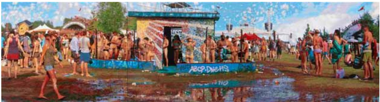
RÖMER + RÖMER: Shower Tower Oase (2014) | 200 x 750 cm (Triptychon) | Öl auf Leinwand | © RÖMER + RÖMER, Courtesy Galerie Michael Schultz / Foto: Eric Tschernow

Folgende Pressebilder stellen wir auf Anfrage zur nicht-kommerziellen Verwendung im Rahmen einer aktuellen redaktionellen Berichterstattung über RÖMER + RÖMER und ihre Ausstellung „Wo ist eigentlich GESTERN?“ sowie unter Angabe der Credits honorarfrei zur Verfügung. Weitere Motive und Bildformate auf Anfrage.