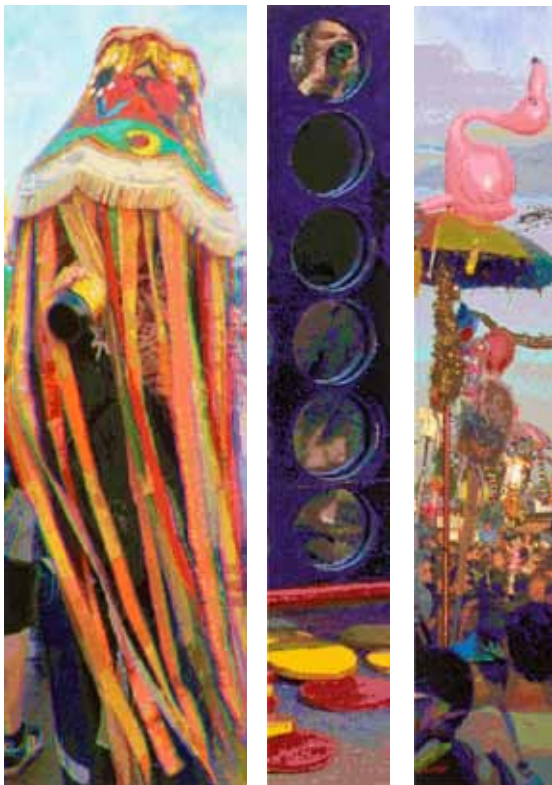
links: RÖMER + RÖMER: Schaumwein-Leuchtkörper (2015) | 290 x 90 cm | Öl auf Leinwand | © RÖMER + RÖMER, Courtesy Galerie Michael Schultz / Foto: Eric Tschernow