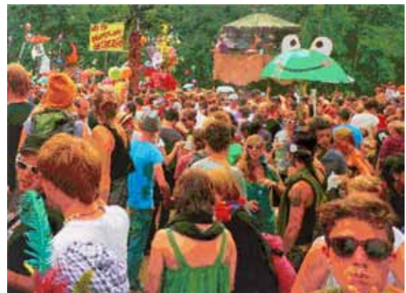
RÖMER + RÖMER: Wo ist eigentlich GESTERN? (2015) | 110 x 150 cm | Öl auf Leinwand | © RÖMER + RÖMER, Courtesy Galerie Michael Schultz / Foto: Eric Tschernow